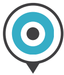
Accuracy & Speed

Many pharmacies' workflow requires concurrent tasks like checking in inventory, filling prescriptions, and accessing reports for things to run smoothly and efficiently. Since the RxSafe 1800 now comes with an RxAWS™ (Auxiliary Workstation), these activities can be accomplished simultaneously without disruption.